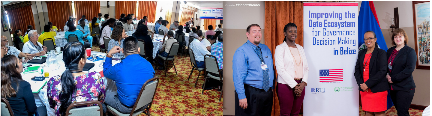
Some of the 113 participants at 2019's First Governance Summit at the Raddison