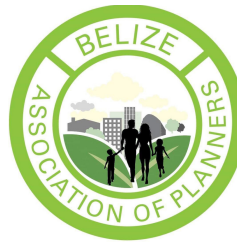
"Making Belize Sustainable"

The Belize Association of Planners Annual General Meeting will be held on June 6, 2020