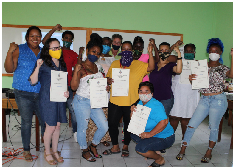
Participants at July's Training Session

Funding for the exercise comes from the United Nations Development Programme-Global Environmental Facility-Small Grants Program and OAK Foundation.